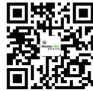
雅昌艺术网 官方微博